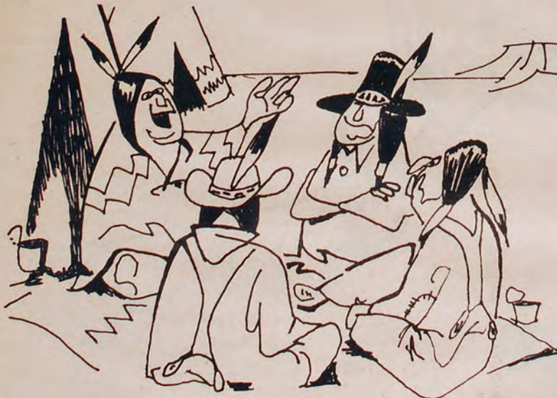
"SINCE THEY ARE GETTING SO SCARCE, WHY DON'T WE PRESERVE THE BUFFALO AND HUNT THE WHITE MAN?"