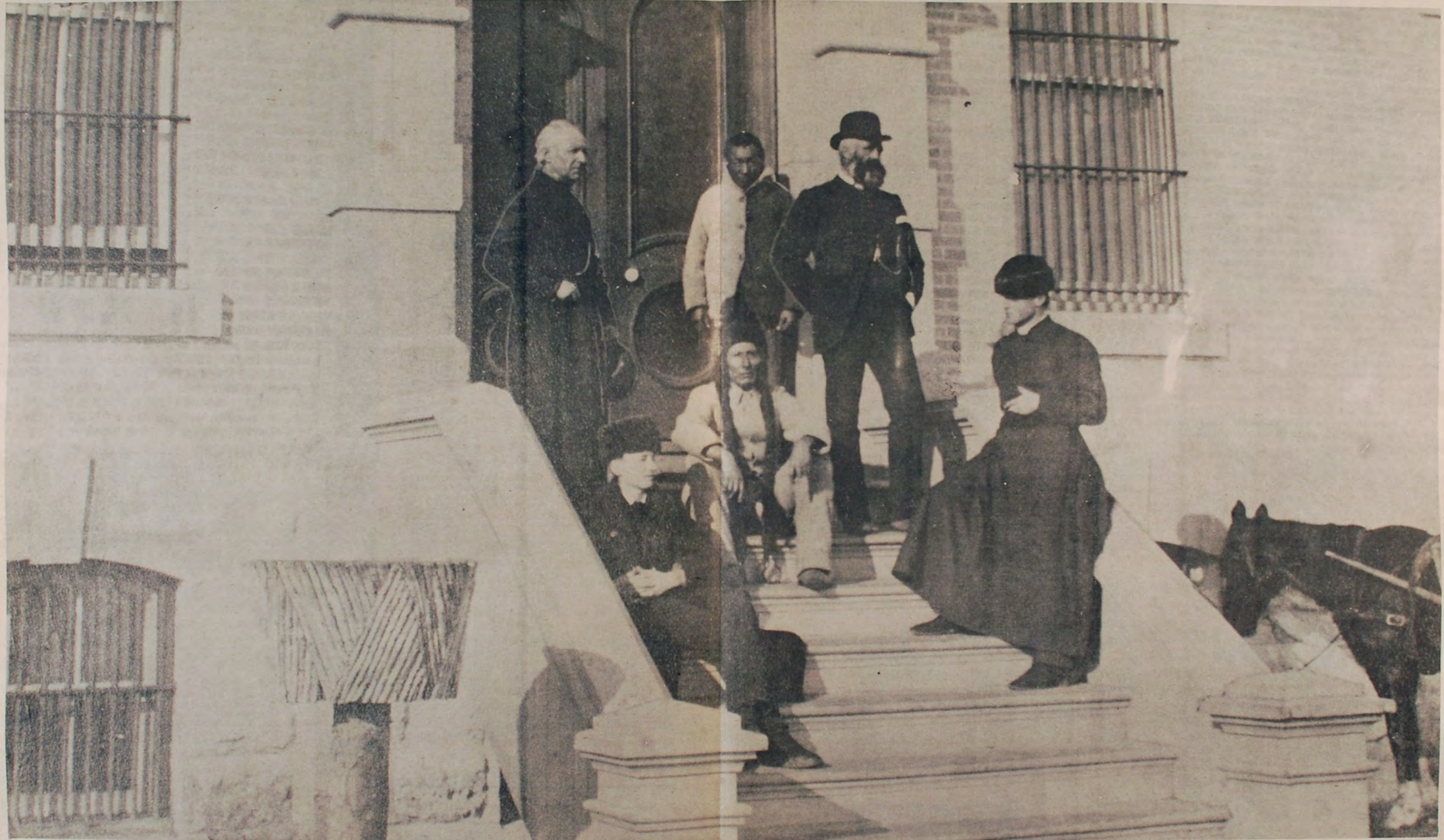
STONEY MOUNTAIN PENITENTIARY 1886